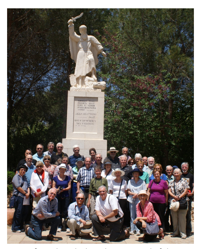
The statue of Prophet Elijah at the courtyard of the Carmelite Sanctuary in Israel, Holy Land Trip