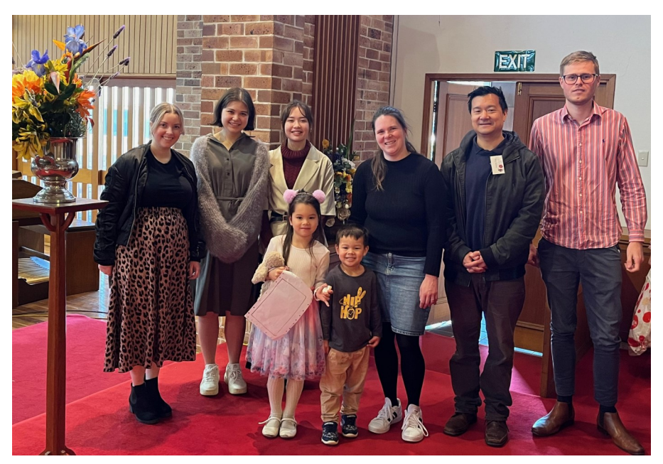
Some of the younger congregation of St Ives Uniting Church