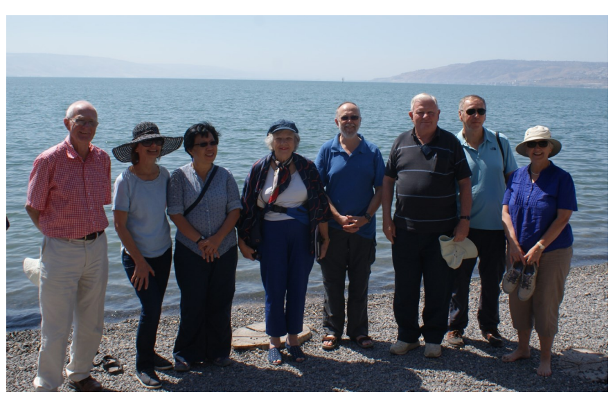
The St Ives group at the Sea of Galilee, Holy Land Trip