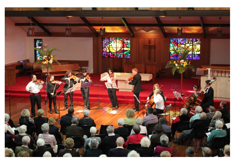
Musical group at worship service