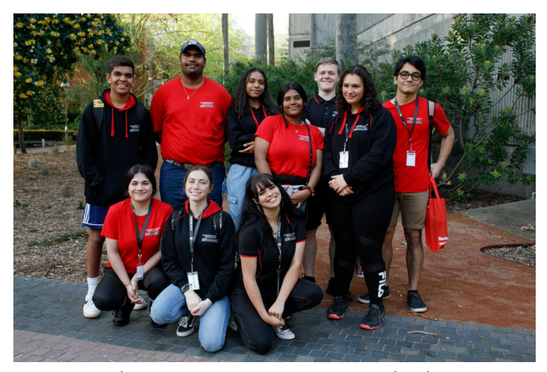
Indigenous Engineering Summer School